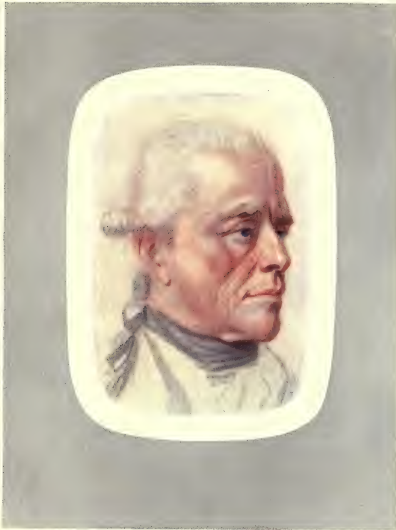
PRINCE FRANZ W. HOHENLOHE BY HEINRICH FRIEDRICH FÜGER